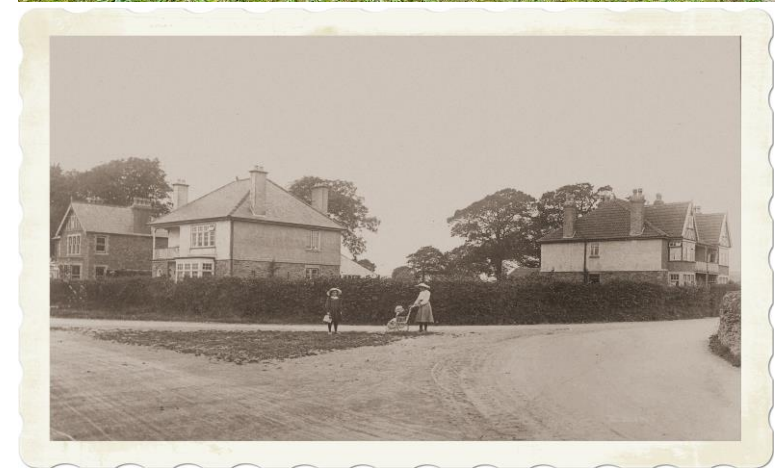
The nearly new Stowell House at about the time of the First World War